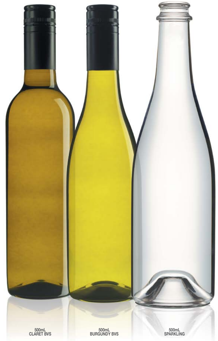
500mL CLARET BVS